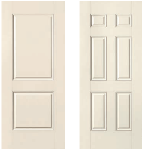
2-Panel Square Top $220 2'8" x 7'0" 2'10" x 7'0" 3'0" x 7'0"